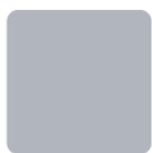
VISION PEARL W-019