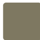
NORMAL OAK W-029