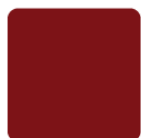
CRIMSON RED W-023