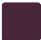
DARK VIOLET W-020