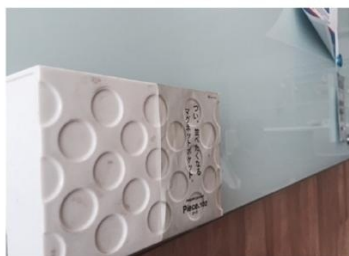
MAGNETIC PENSIL BOX • Custommade for glassboard