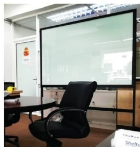
MOBILE GLASS BOARD