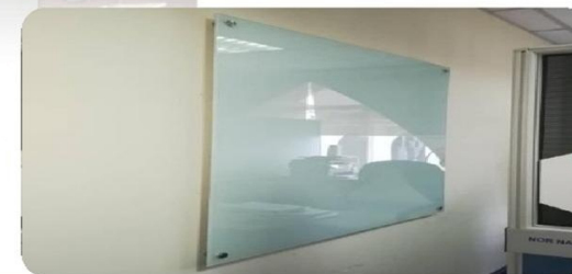
Pusat Pengurusan Penyelidikan & Inovasi (USIM)

Shelton Jaya Sdn Bhd (1231177-D) Showroom (Puchong) 19 & 17, Jln Bandar 6/1, Pusat Bandar Puchong, 47610 Puchong, Selangor