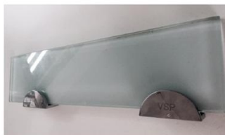
GLASS TRAY • Glass Tray for whiteboard. • 8mm thick tempered glass w stainless steel holder.