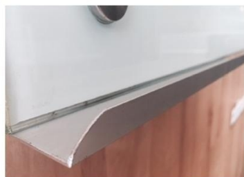
ALUMINIUM TRAY • Aluminium Tray for glass whiteboard