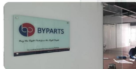
ByParts (Asia) Sdn Bhd