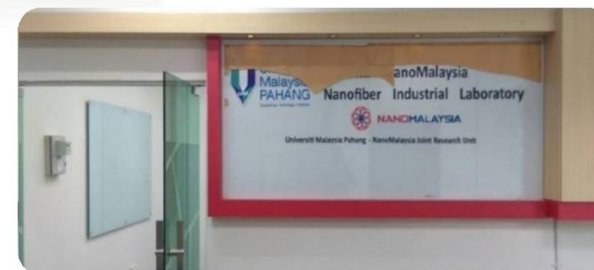
Universiti Malaysia Pahang- NanoMalaysia Joint Research Unit